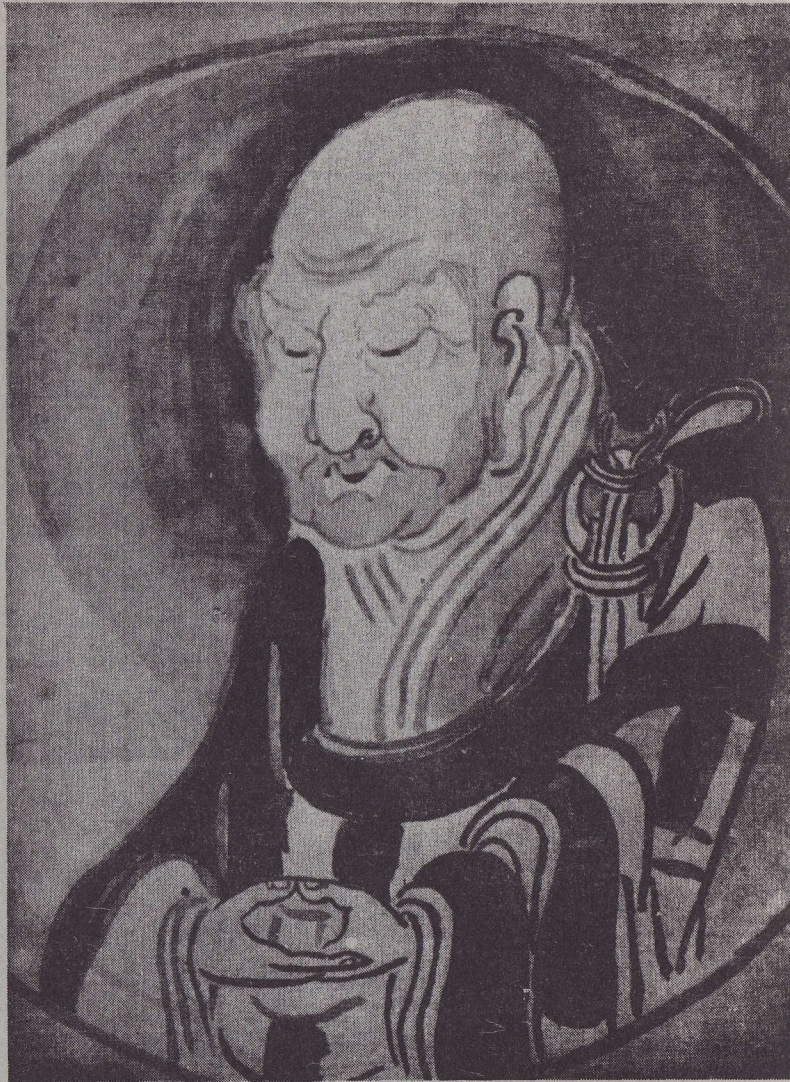
Hakuin Zenji : self-portrait