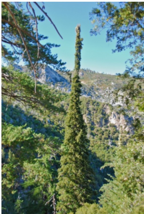
Santa Lucia fir ( Abies bracteata). Cone Peak, Ventana Wilderness, Los Padres National Forest, Monterey County, CA.