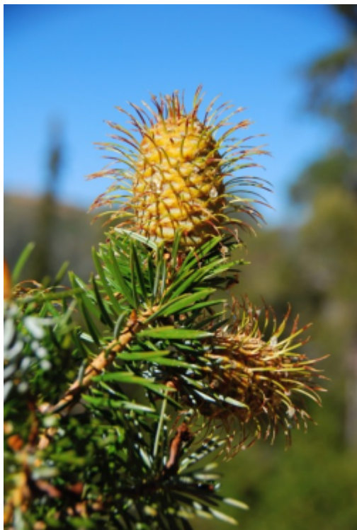
Santa Lucia fir ( Abies bracteata). Cone Peak, Ventana Wilderness, Los Padres National Forest, Monterey County, CA.