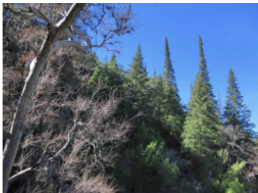
Santa Lucia fir (Abies bracteata). Villa Creek, Los Padres National Forest, Monterey County, C.A.