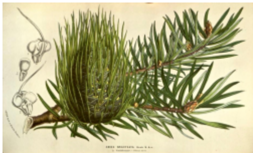
Santa Lucia fir ( Abies bracteata ), from Flore des Serres et des Jardins de l'Europe , Vol. 9, 1854–55.