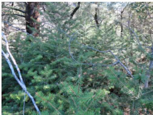
Santa Lucia fir ( Abies bracteata ) saplings. Villa Creek, Los Padres National Forest, Monterey County, CA.