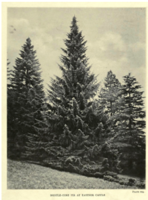
BRISTLE-CONE FIR AT EASTON CASTLE