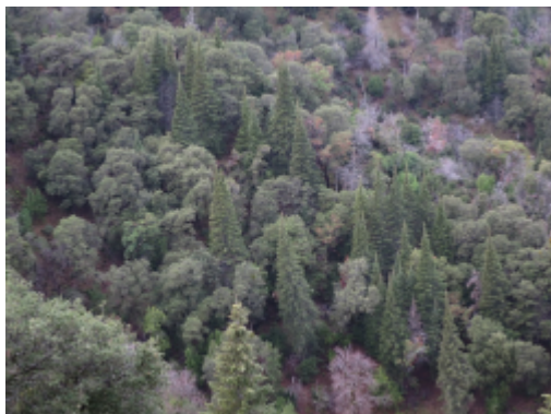
Santa Lucia fir (Abies bracteata). Miller Creek Canyon, Ventana Wilderness, Los Padres National Forest, Monterey County, C.A.