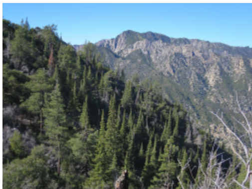
Santa Lucia fir (Abies bracteata) . Ventana Cone area, Ventana Wilderness, Los Padres National Forest, Monterey County, C.A.