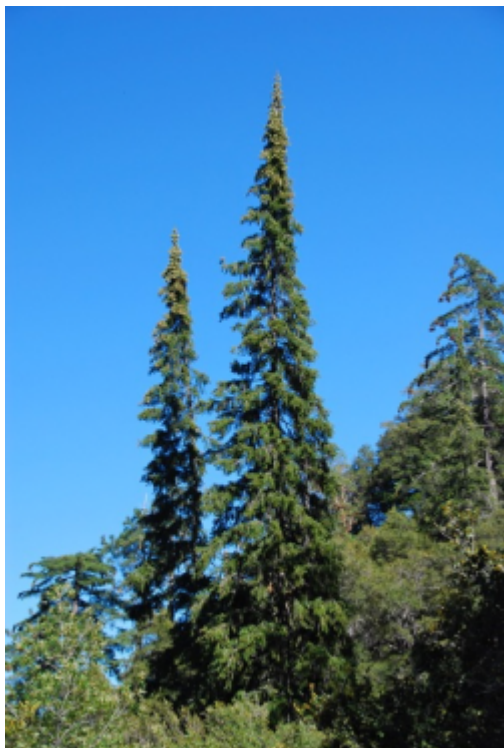
Santa Lucia fir ( Abies bracteata). Cone Peak, Ventana Wilderness, Los Padres National Forest, Monterey County, CA.