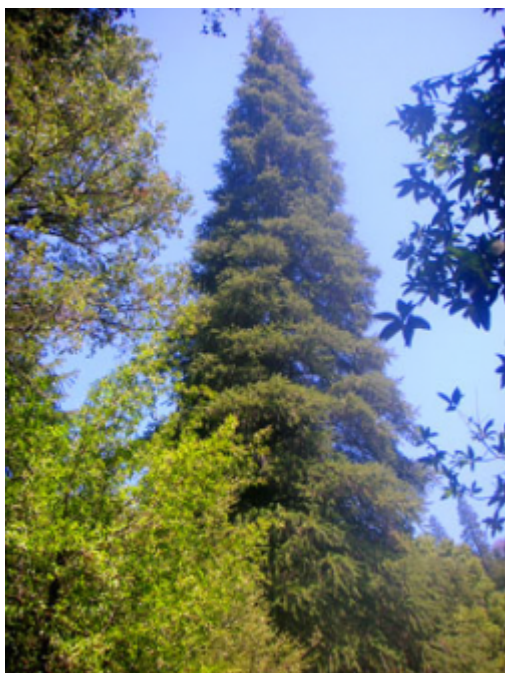
Santa Lucia fir ( Abies bracteata ), registered as a California Big Tree. 127 ft high. Los Padres National Forest, Monterey County, CA.