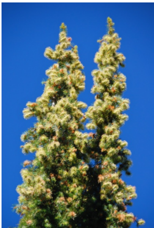
Santa Lucia fir ( Abies bracteata). Cone Peak, Ventana Wilderness, Los Padres National Forest, Monterey County, CA.