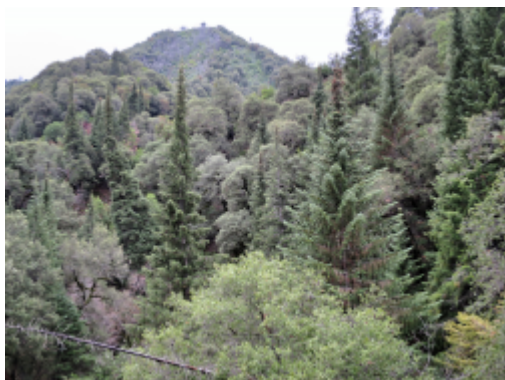
Santa Lucia fir (Abies bracteata). Miller Creek Canyon, Ventana Wilderness, Los Padres National Forest, Monterey County, C.A.