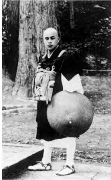
Shunryu at Eihei-ji in monk's pilgrimage gear, c. 1930.