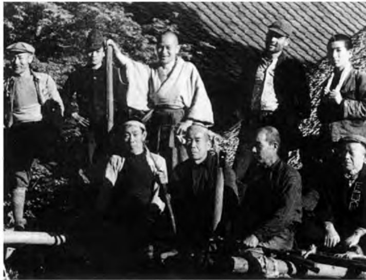
Shunryu (top center) with temple member-workers at Rinso-in, c. 1956.