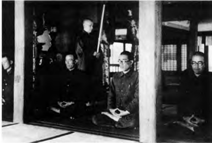
Shunryu carrying the stick (kyosaku) at Rinso-in during the Pacific war, while prep school students informally called the High Grass Mountain Group (Takakusayamakai) sit zazen, c. 1945.