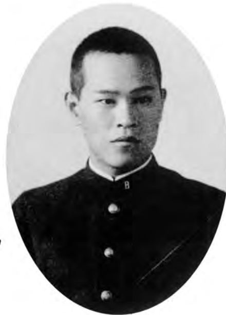
Shunryu, age 25, in the Komazawa University senior yearbook, March 1930.