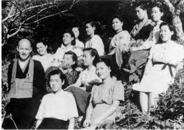
Shunryu with young women's study group, c. 1947.