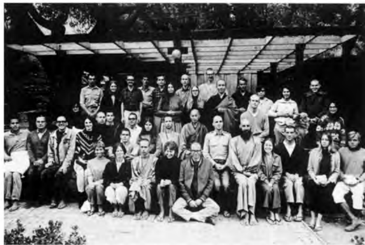
Tassajara, Zen Mountain Center, first practice period work-time photo. Summer 1967.