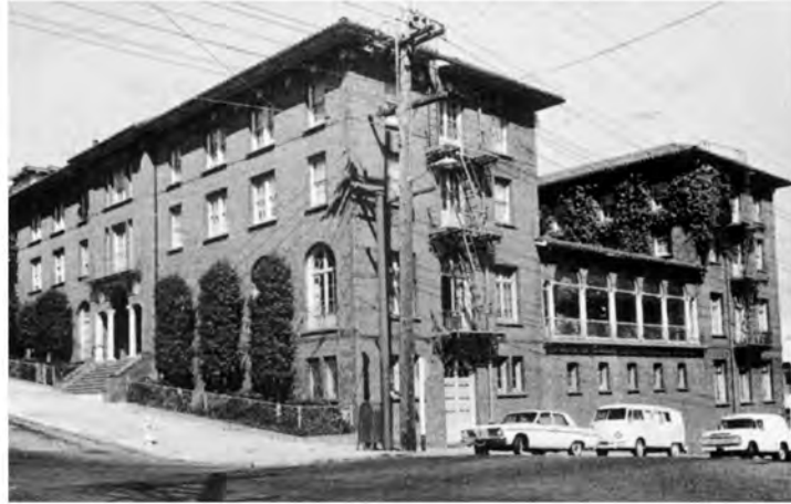
The City Center of the San Francisco Zen Center at 300 Page, c. 1969.