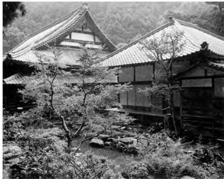
The back pond at Rinso-in, 1996.