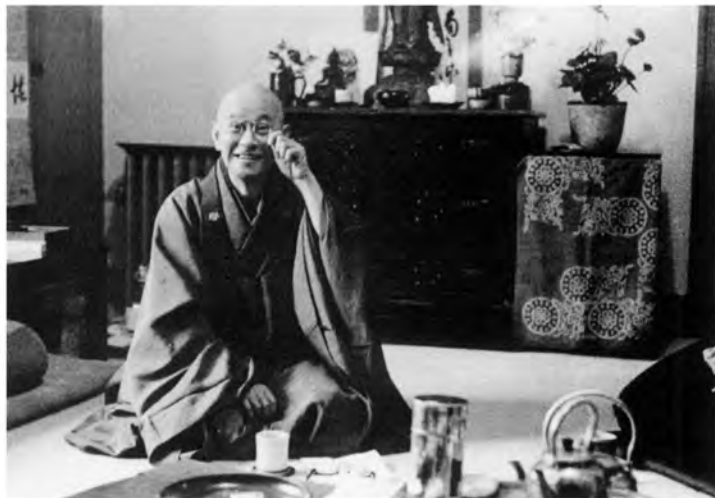
Shunryu Suzuki at the City Center, c. 1970.