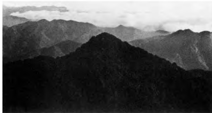
A view of the Santa Lucia Mountains as seen from the ridge on the road to Tassajara.