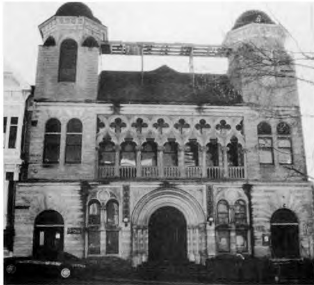
Sokoji, Soto Zen Mission, 1881 Bush Street, San Francisco, c. 1965.