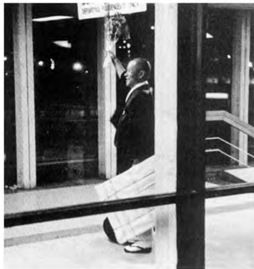
Shunryu Suzuki at gate waving goodbye.