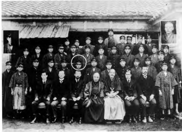
Earliest existing photo of Shunryu Suzuki, age 14, at upper elementary school graduation in Mori, March 1919.