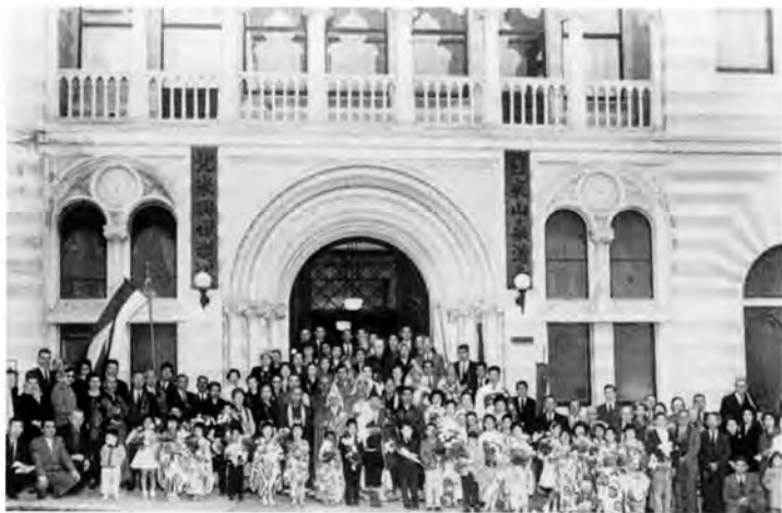
After Shunryu Suzuki's Mountain Seat Ceremony, members of both Japanese congregation, Zen Center, and guests in front of Sokoji.